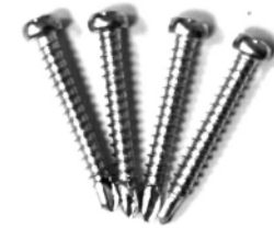
SELF TAPPING SCREWS QUANTITY: 4. LENGTH: 27MM. HEAD TYPE: BUTTON CROSS HEAD.

NOTES: 1. TO BE SUPPLIED IN CLEAR PLASTIC BAG.