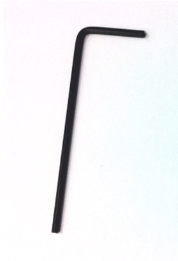
HOUSING ALLEN KEY QUANTITY: 1. DIAMETER: 1.25mm