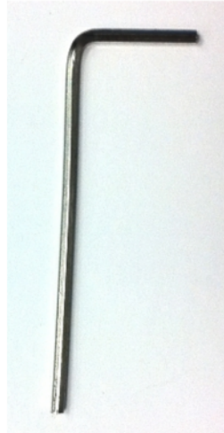
LENS ALLEN KEY QUANTITY: 1. DIAMETER: 1.5mm